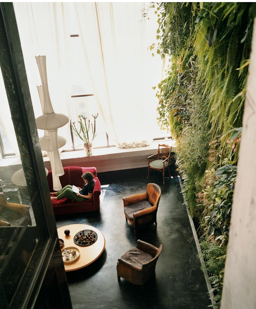
The Dimanches' indoor garden wall is 20 by 23 feet, dominating the living room in the best possible way (above). Light floods the whole house as well as the courtyard, with its more standard garden (right).

to put the wall inside his house!" Dimanche remembers. The adventure had begun. Two years on, it is hard to imagine the space without its forest canopy, a canvas of the living with some 150 tropical, low-light species assembled in harmony. It begins as a field of texture near the ground, then runs through violet and amber arcs of flowers and other ruddy blooms, broadening out near the ceiling into trees that overhang the room like a sheltering forest. It strikes an easy balance with both the raw elements of the home (concrete, metal beams, a transparent glass elevator that pierces the heart of the five-story structure) and the charming bric-a-brac of a family's everyday existence (country-kitchen stools, orchids coaxed into bloom, battered leather armchairs that sigh beneath your weight). The effect, Dimanche agrees, is "very calming."